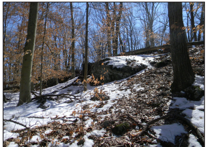
This picturesque ridge is situated on the southwestern edge of the preserve.

As shown in this aerial photo, taken from the southern edge of the